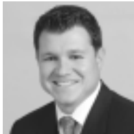
By Bill Sammon

Weighing the pros and cons of various stock exchange options